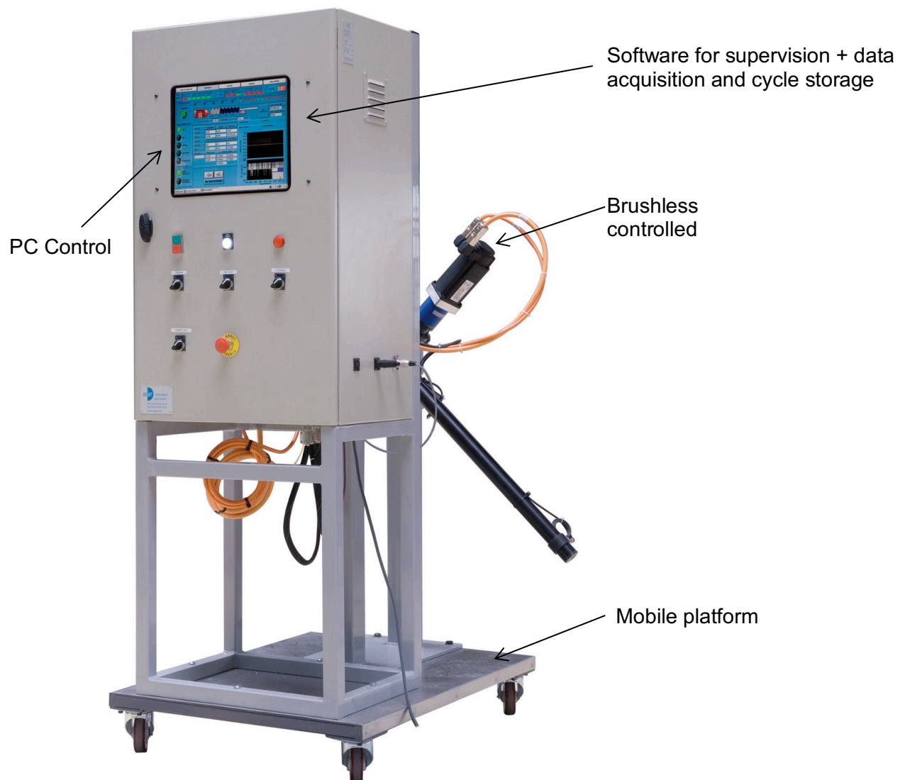
Picture 2: RTM Unit with PLC (This presentation of the equipment can be adapted to customer specification).

The system is used to stir resin inside of the piston and to record temperature of resin in the piston prior to inject. This cap needs to be removed before the injection.